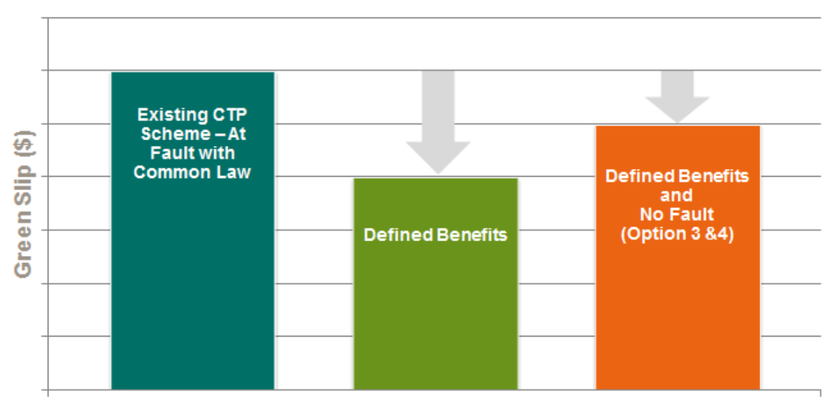
GRAPH 1: How Reform is Funded